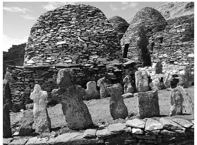
7th Century beehive Huts, Skellig Michael © Sean Adcock

Travelling WEST on A55 take the Conwy turn (Junction 18) and follow signs for Conwy. Go past the castle and follow the sign for town centre. Go past Conwy Visitors Centre on the left, take the 2nd left into Upper Gate Street and proceed up the hill for about 2.5 miles towards the Sychnant Pass. Pensychnant entrance is on the right after Sychnant Pass House Hotel. If you go over the brow of the pass, between high walls, you have gone too far.