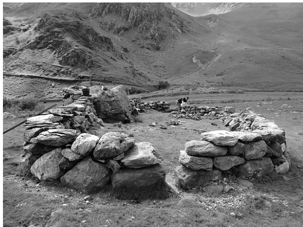
Restored entranceway to pen

The Cheshire Branch will be joining us again this year and we hope to complete the renovation of the milking pen at Blaen y Nant.