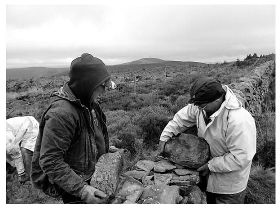
Coping with the weather. taster Day Moel Famau, May.

We have also had some reasonable press coverage of our programme and the DSWA/Princes Countryside Fund Voucher scheme. I have copies of articles from Denbigh Free Press and