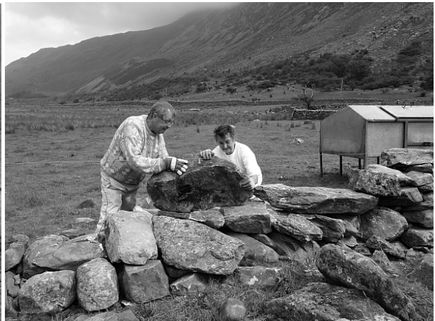
Building stone, topstone or hearting... who knows?

This project was started in 2012, continued in 2013, and was rained off last year. We're hoping for better luck this year and hope to complete it. Much of the wall is only one stone thick, and whilst not as high and challenging as the single wall at Pen y Pass it is none the less a valuable example of this type of structure, and provides a rare opportunity for Branch members to have a go and get an insight into what is involved. Colin has described the walling method as "a liberating experience. Most of the rules of normal walling are put to one side and imagination, trial and error and downright cheating come to the fore." A chance to cheat... what more can one ask for?