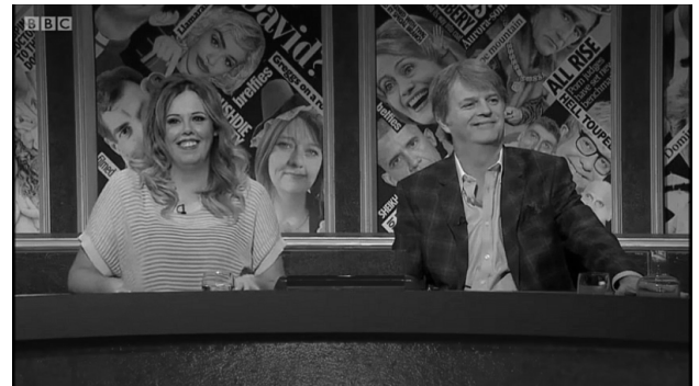
Paul Merton and Roisin Conaty have a giggle over mash hammers

If I could have only one *** it would be ***** Nicola Sturgeon asked Sean Connery for advice on ***** Stonechats meetings this year have attracted *****